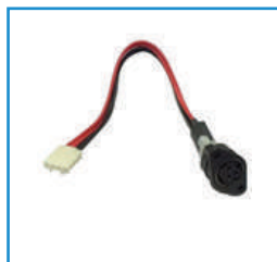
Power Adapter Cable