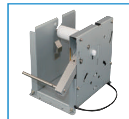
Large Paper Holder